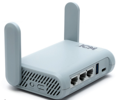
WiFi Access Point Device

EL SALVADOR When a pastor in El Salvador received an Access Point as part of an ICM-led training, he decided to test it out in his neighborhood. As he walked and visited people, he showed them the Access Point, seeing if they could connect to it on their phones. The pastor mentioned that many had never