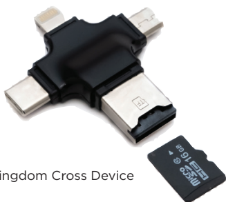
Kingdom Cross Device

Instruct the wise and they will be wiser still; teach the righteous and they will add to their learning.