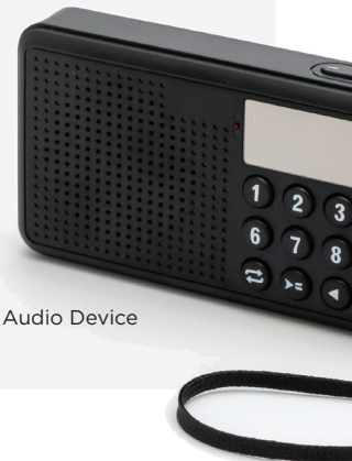
Solar Audio Device